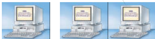
Tester 1 David Tester 2 Muna Tester 3 Jass

These Testers are now Testing application in different test environments